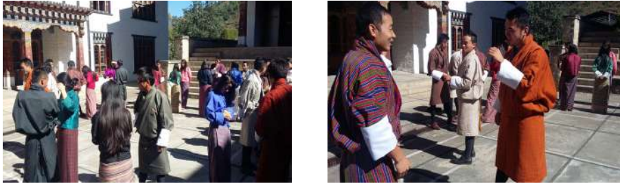
FIGURE 2. Creating more opportunities to interact through circle chat activity.