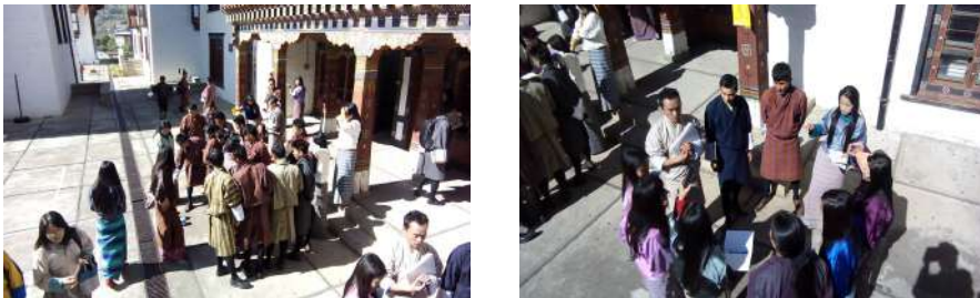
FIGURE 1. Jig-saw strategy as a means to create opportunities to maximise interaction.

Using student-centred approaches can help create opportunities to interact in the class (Rai, 2002; Rinchen, 2006; Robertson, n.d.; Sherab, 2013a). Robertson (n.d.) states that think-pair-shares and circle chats are very simple and effective strategies to make students participate in the class. To create more opportunities in the class, I lectured less in the class, exercised more activity-based lessons, and always prepared the lesson well.