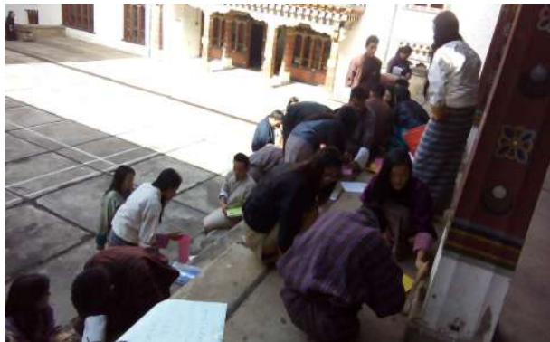
FIGURE 3. Incorporating collaborative play as a means to maximise interaction.

It has been found that a teacher's personality and students' hesitation to speak in the class are closely related. Ferlazzo (2013) states that teacher should make students realize that they are cared for and should be approachable at all times. If teachers maintain a healthy relation with students and incorporate humour in the class, students interact and learn more (McNeely, 2011; Weimer, 2013). In the baseline data, it has been identified that I usually had serious looks and that I needed to use humour (Sherab, 2013a) in the class. McNeely (2011) states that when teachers share a laugh or a smile with the students, they help students feel more comfortable and open to learning. Using humour brings enthusiasm, positive feelings, and optimism to the classroom. Besides this, Eagen (2011) also states that humour encourages an atmosphere of openness, develop students' divergent thinking, improve their retention of the presented materials, and above all it is a valuable teaching tool.