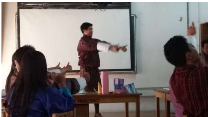
FIGURE 4. Giving thumbs up cheers to one of the participants for his opinions to encourage more interaction.

Cheers such as “Thumbs up”, “Wow cheers”, “applauses” were given to the participants. Moreover, whether participants gave correct or incorrect answer, I always acknowledged their responses and accepted their answer. Thus, participants interact more, even if they are not sure with their responses.